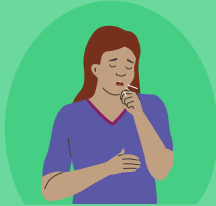
Cough & sneeze into your elbow

Diphtheria is spread by infected droplets from coughs or sneezes.