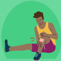
Keep wounds clean & covered

Diphtheria can be spread skin to skin, from contact with an infected ulcer or sore.