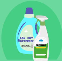
Clean household items & surfaces

You can get sick by touching dirty sheets, towels, clothes, or household items.