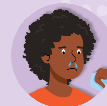
▶ Runny or stuffy nose