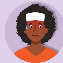
▶ A fever