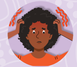
▶ A headache