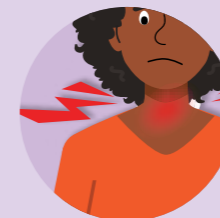
▶ Sore throat