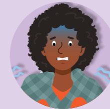
▶ The chills