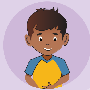
People younger than 5 years old

Anyone can get the flu. But the flu can be worse for: