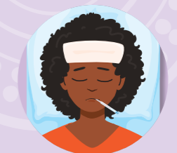
▶ The flu can also make you feel very tired