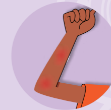
▶ Pain in your joints and muscles