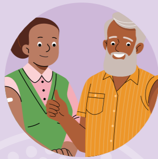
People 65 years and older