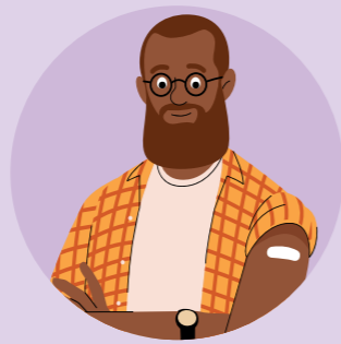
Aboriginal and Torres Strait Islander people