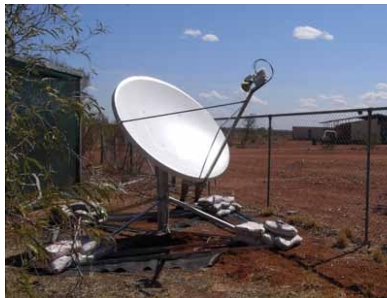
Satellite at Puntukurnu Aboriginal Medical Service

A real benefit is also being realised for the Registered Nurses who are now completing CRANA courses on-line to maintain their registration from home.