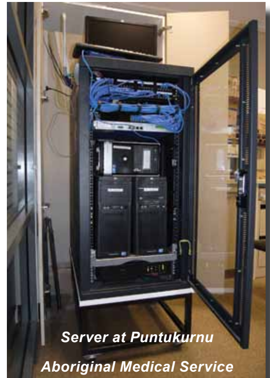
Server at Puntuturnu