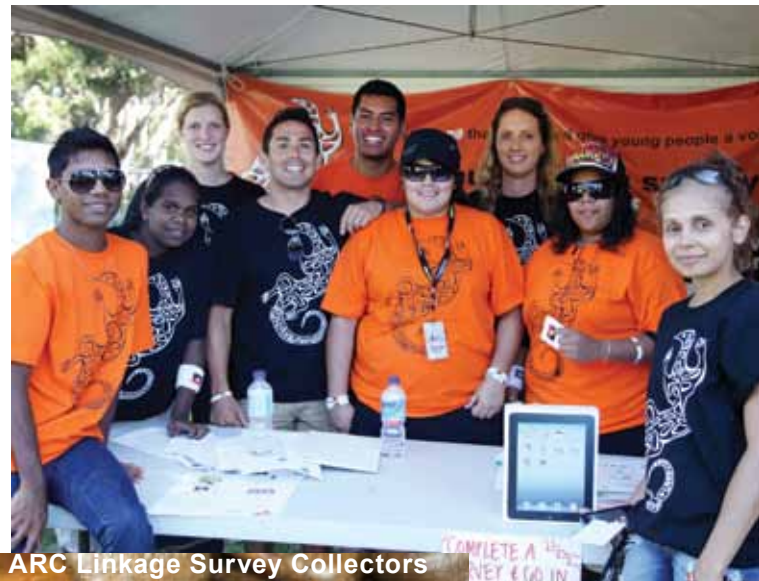
ARC Linkage Survey Collectors

Eight volunteers assisted with the survey collecting, with the event kicking off at 11am with the first survey completed at 11.15am.