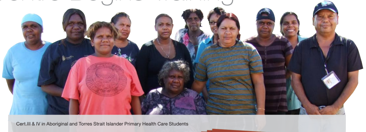
Cert.III & IV in Aboriginal and Torres Strait Islander Primary Health Care Students

The Perth campus of the AHCWA T&D Centre has started 'Certificate III' and 'Certificate IV courses in Aboriginal and Torres Strait Islander Primary Health Care'.