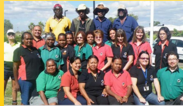
Congratulations to the Mawarnkarra Health Service staff members

AHCWA continues to have an ongoing commitment to accreditation with more than 30 people from across the State attending the AHCWA Quality Management Services (QMS) joint workshop on QIC accreditation in April.